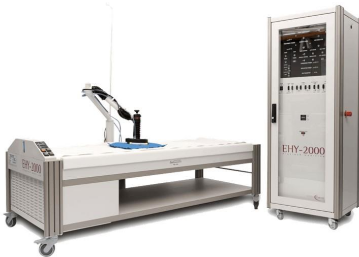
EHY-2000 Treatment to a localized area up to 30 cm in diameter