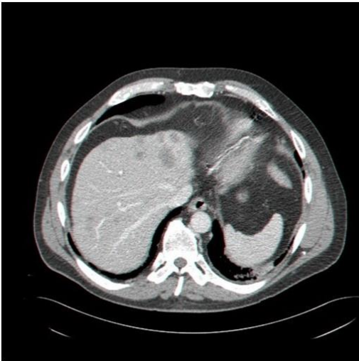
Pancreatic cancer, intra-abdominal spread, liver metastasis.