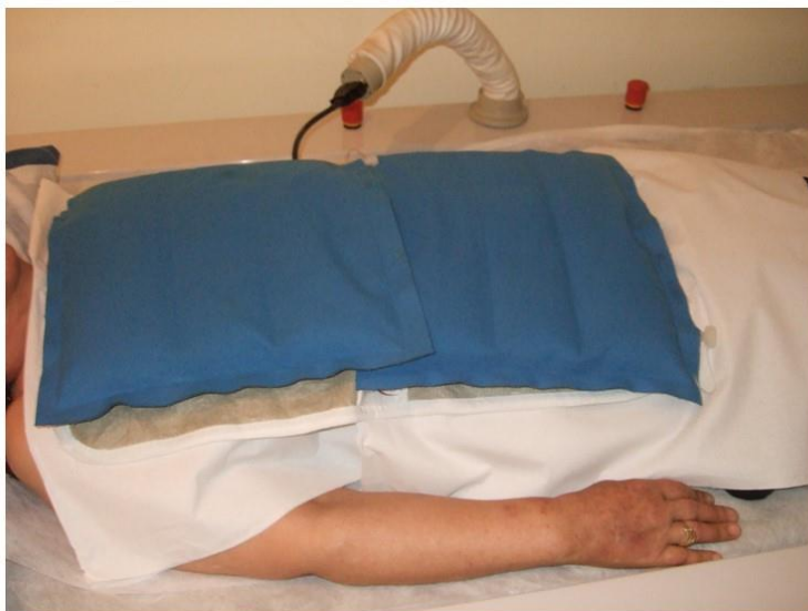
Treatment to the chest, abdomen and pelvis with EHY-3000