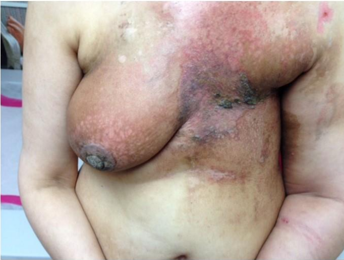
Complete response of the chest wall disease