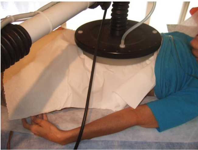
Localized treatment to liver area with EHY-2000