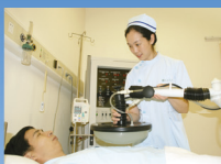
Local Hyperthermia (Hungarian Local Hyperthermia Machine, Onco Therm EHY-2000)