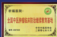
National Education Base for Cancer Treatments