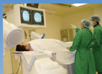
Minimally Invasive Interventional Therapy