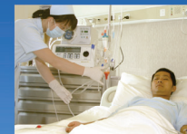
Medical Ozone Therapy