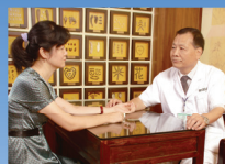
Traditional Chinese Medicine Syndrome Differentiation and Treatment