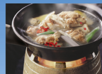
Dietetic and Herbal Cuisine Therapy