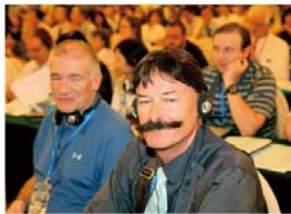
In May 2011, the First Meeting of The International Academic Conference on Natural Medicine was held in Guangzhou, China. Over 400 scholars from nearly 30 countries and regions attended the event.