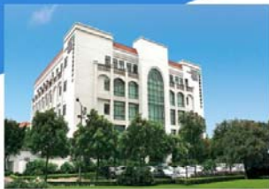
Clifford Hospital International Natural Medicine Center